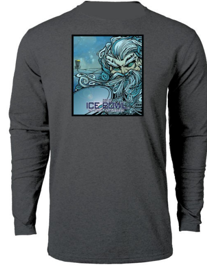
CHARCOAL HEATHER Z700 - FB 9"