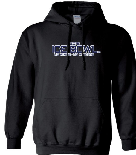
BLACK GI8500 FF- 9"