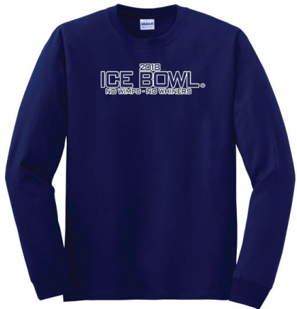
NAVY GI5400 - FF 9"