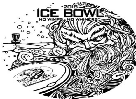
How most discs are hotstamped

The Journey is Gateway's newest long range driver. It has a low profile and long wing for speed and a perfect transition from the nose to the flight plate, allowing it to have a long, straight, controllable flight with just the right amount of overstability. It has enough resistance to turn for the big arms, but it's not too overstable for the smaller arms and newer players. Players of all skill levels should be able to make the Gateway Journey one of the longest throwing discs in their bag.