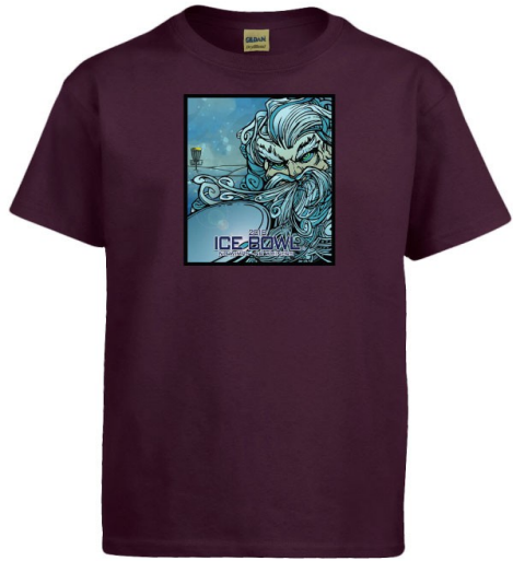
BLACKBERRY GI5000 FF -9"