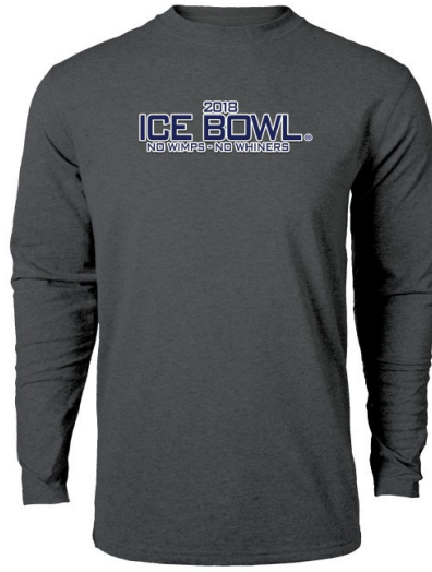
CHARCOAL HEATHER Z700 - FF 9"