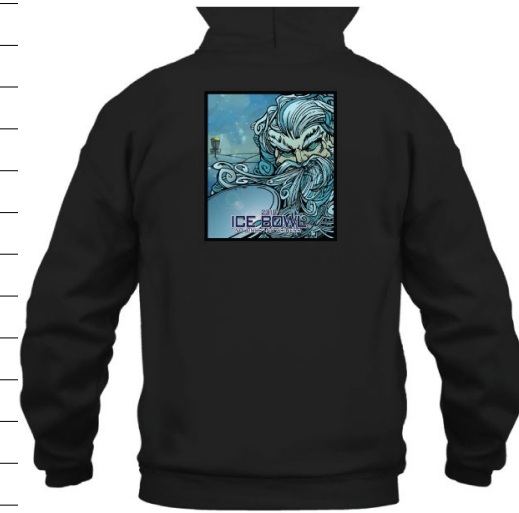
BLACK GI8500 FB - 9"