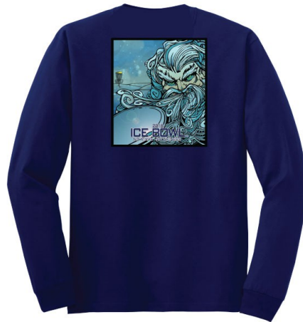
NAVY GI5400 - FB 9"